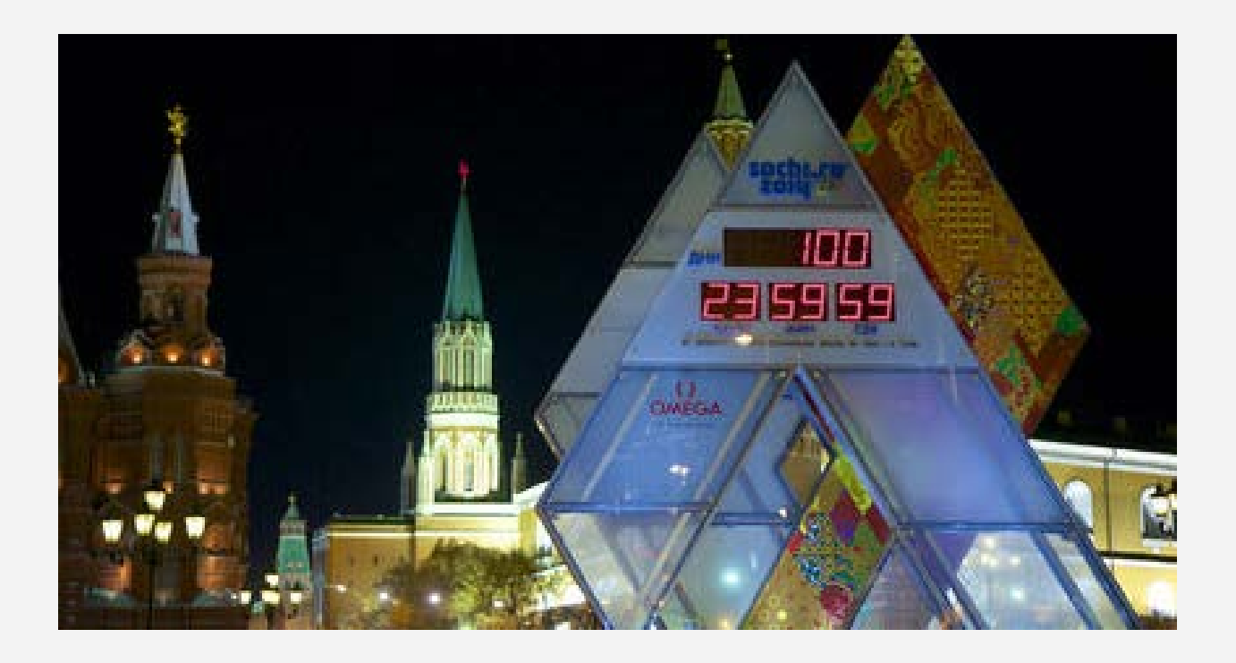
Sochi, Soviets, and czars: How much do you know about Russia?